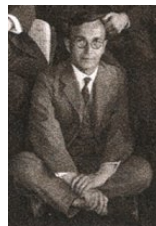
Tibor Radó, BB inventor

A small variation of the step counter function leads to the Busy-Beaver Problem: