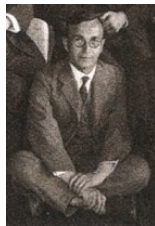
Tibor Radó, BB inventor

A small variation of the step counter function leads to the Busy-Beaver Problem: